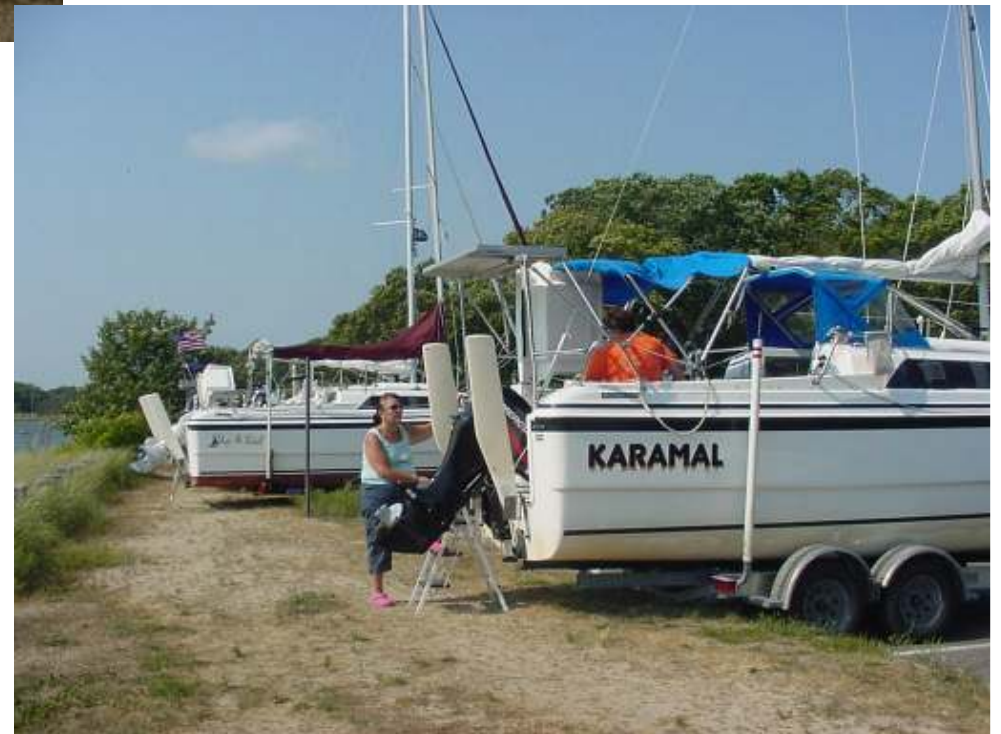
Rigging the boats