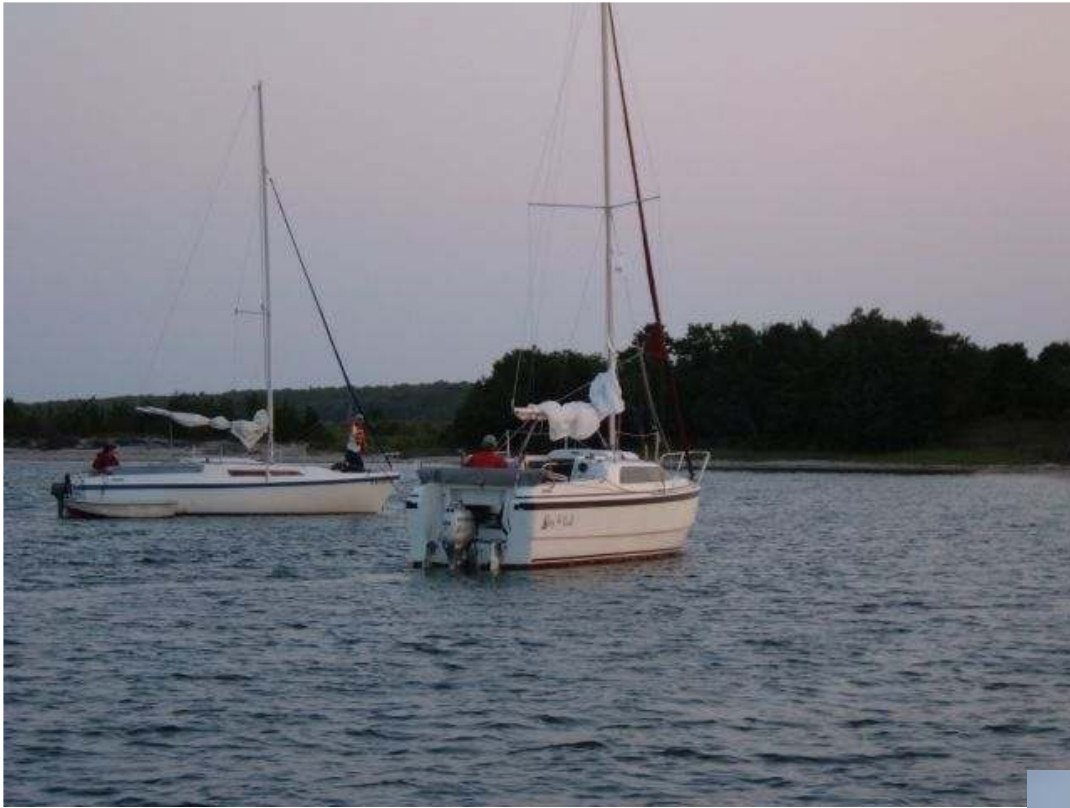
“Spice” & “Zemer” rafting up

“Knot Last” welcomes “Up 4 Sail” to Red Brook Harbor