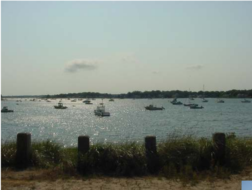
Wareham Launch Ramp