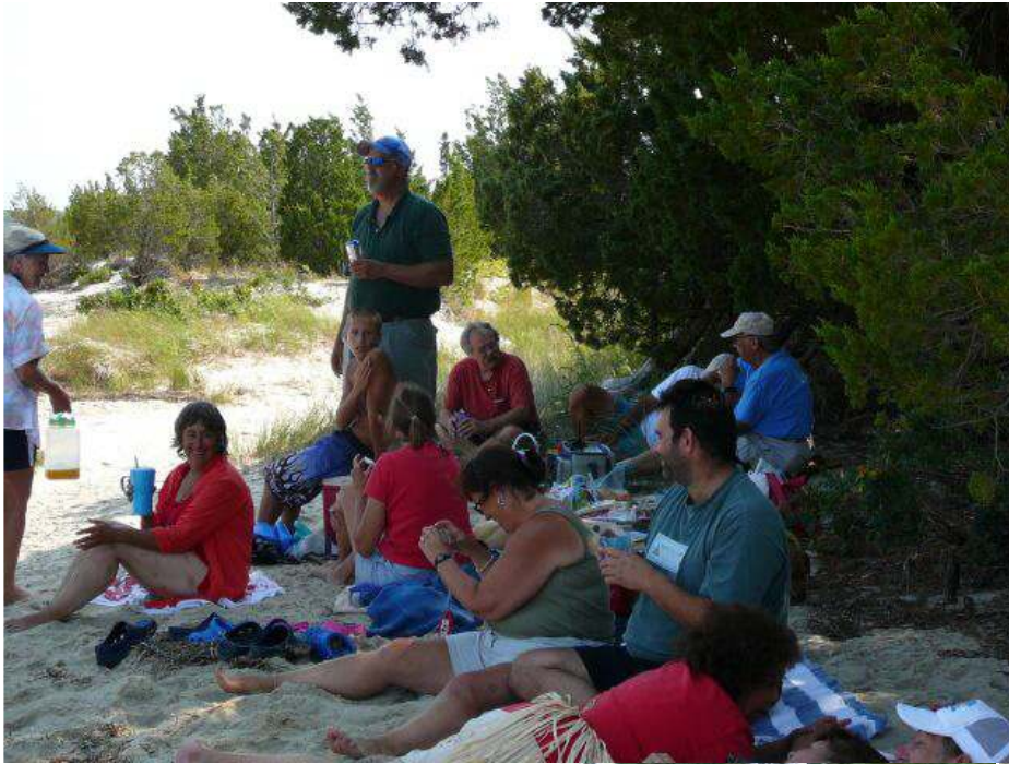
Margaritas are served!